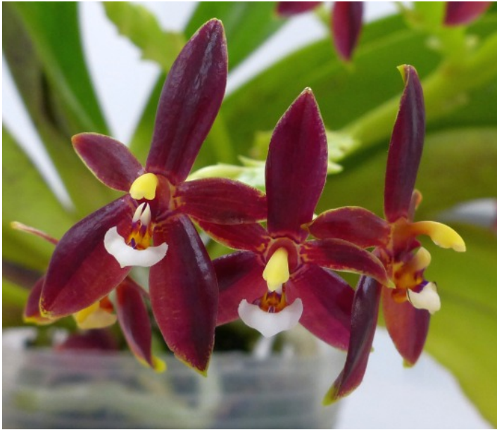
Phalaenopsis cornu-cervi "Calvin" HCC 77pts owned by Crystal Star Orchids