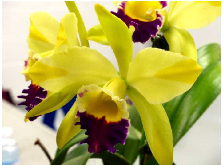
Rlc Green Rattana "Golden Angel" (Rlc Greenwich x Rlc Udomrattana) HCC 77 pts owned by Crystal Star Orchids