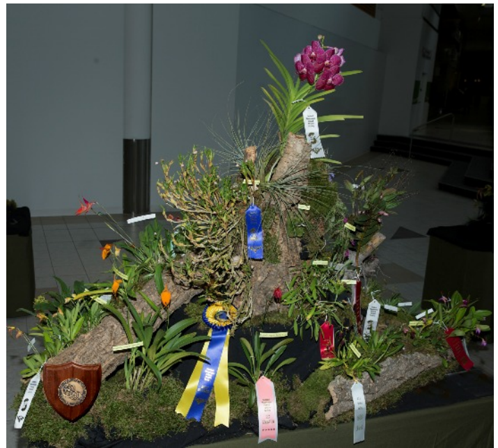
Central Vancouver Island Orchid Society Show - 01 Oct 2015, Nanaimo BC COC Award - Best Individual Display - Bryan Emery