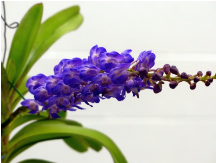
Rhynchoides Memoria Suranaree (Rhynchostylis coelestis x Aerides lawrenceiana) AM 82 pts owned by Synea Tan