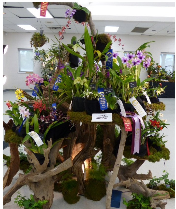
Central Ontario Orchid Society Best in Show, COC and AOS awards