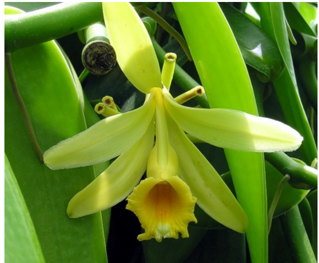
Vanilla pompona - another source of vanilla flavouring from Mexico and Central America

I was fascinated to learn about Vanilla , both as an orchid genus and about the process of producing vanilla. Lots of pictures were taken with the intent of developing an illustrated presentation about this interesting genus. Watch for news of this by summer's end.