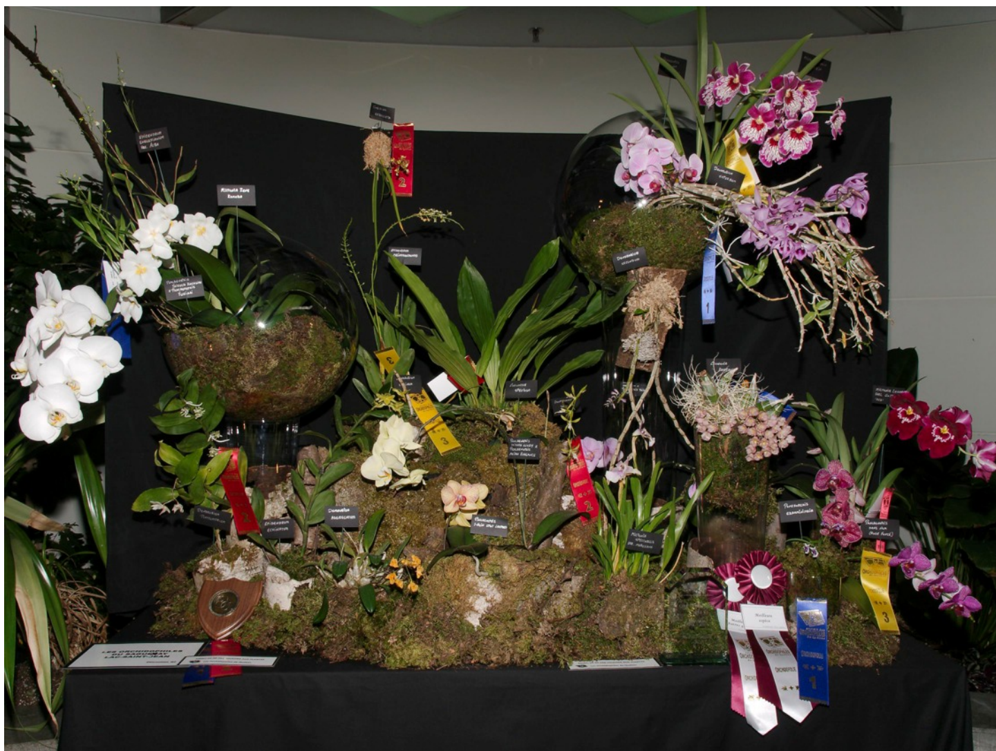
At l'exposition Orchidophiles de Québec the COC Medal Award for the most artistic exhibit went to Les Orchidophiles du Saguenay Lac St-Jean.