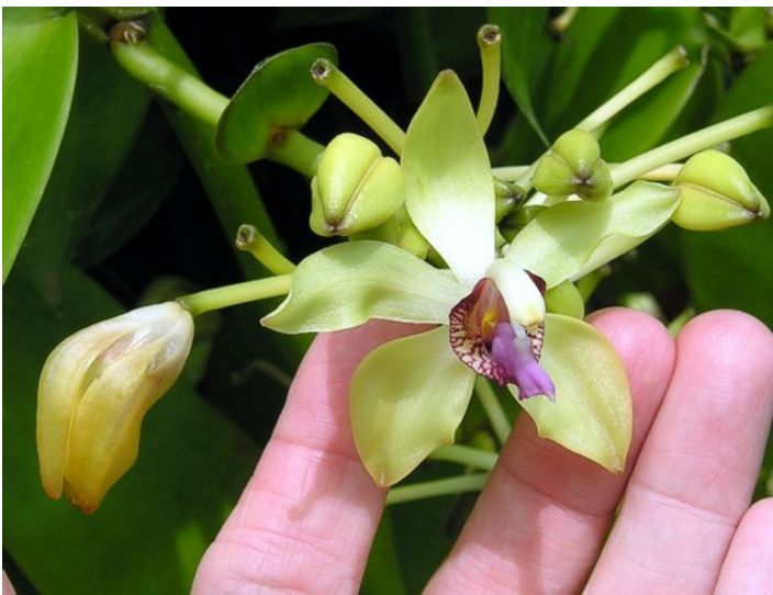
Vanilla africana - West and Central West Africa

The 5th International Orchid Conservation Congress was held in Ile de la Réunion in early December 2014. Reunion Island is located about 800 km east of Madagascar in the Indian Ocean. This volcanic island is an overseas Département of France and hence part of the European Union. One of their major crops is vanilla. We toured was the CIRAD Biological Resources Center (CRB) where the largest collection of Vanilla species in the world is managed in a shade house collection and also conserved using in vitro and cryopreservation techniques. Many different species of Vanilla were in full bloom.