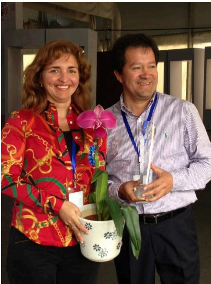
Ecuagenera wins Grand Champion at Shanghai International Orchid Show, March 2014