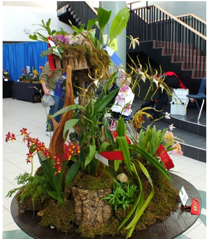
COC Medal won by Orchids in Our Tropics for most artistic display at the London OS show