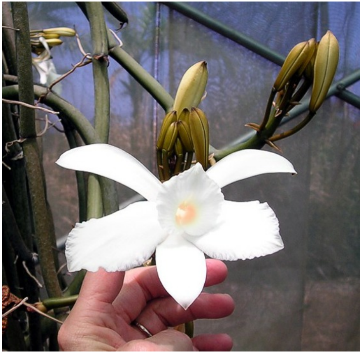
Vanilla phalaenopsis - A leafless species from the Seychelles archipelago

We all appreciate our favourite flavouring for just about anything sweet. Vanilla (vanillin) is a natural product of the orchid, Vanilla planifolia , that grows wild in Mexico and Central America but is now cultivated in tropical plantations around the world. If you thought that this was the only Vanilla species, think again. There are some 100 species found in both the New and Old World tropics. All are vines, some are leafless, and a few have spectacular flowers. Most species do not produce vanillin but could be used through hybridization to introduce diseases that plague vanilla crops.