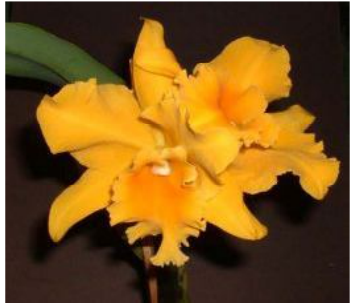
Potinara Hwa Yuan Gold "Yung Kang#2" GM/16WOC