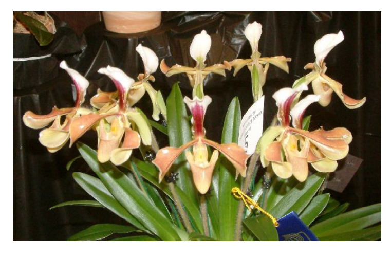
Paphiopedilum villosum, CCM-AOS 85 points