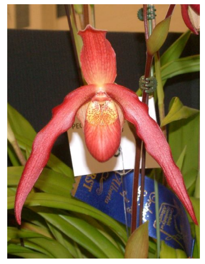
Phragmipedium Fire Cascade, FCC-AOS 90 points

The AOS show trophy for best display was awarded to a display by Dr. Paul Paludet with an average score of 82 points. The COC medal trophy went to the Alberta Orchid Society display for Most Diverse Display of orchid flowers and orchid plants. The AOS judges awarded five plants shown here.