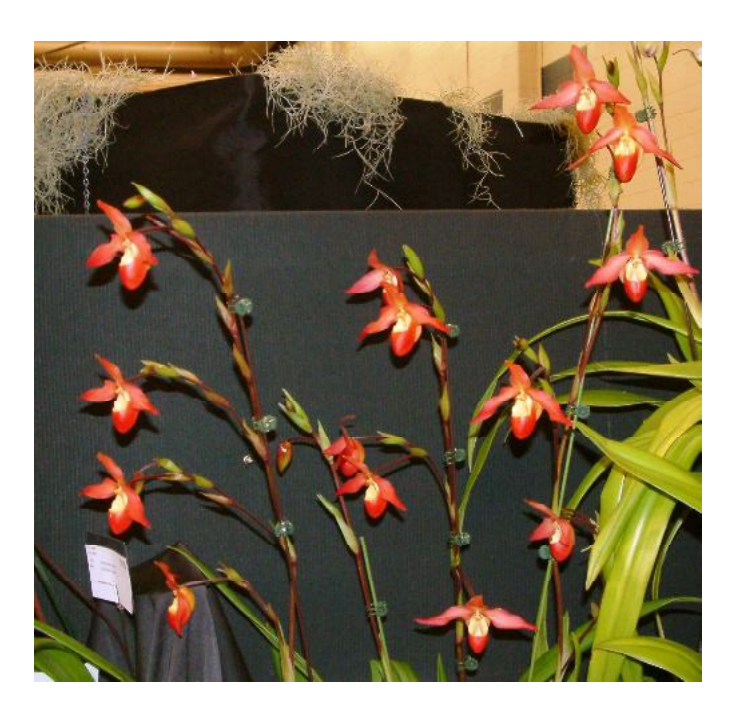
Phragmipedium Eric Young, CCM-AOS 87 points