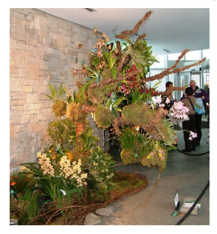
Les Orchidophiles de Montreal took the COC Medal for the Most Innovative and Artistic exhibit