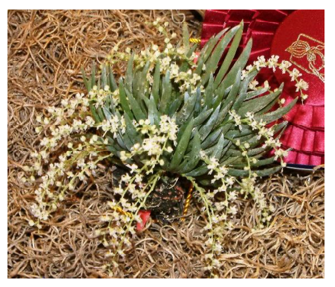
Ornithocephalus manabina, CCM-AOS 85 points