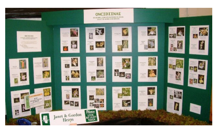
J&G Heaps Education Display