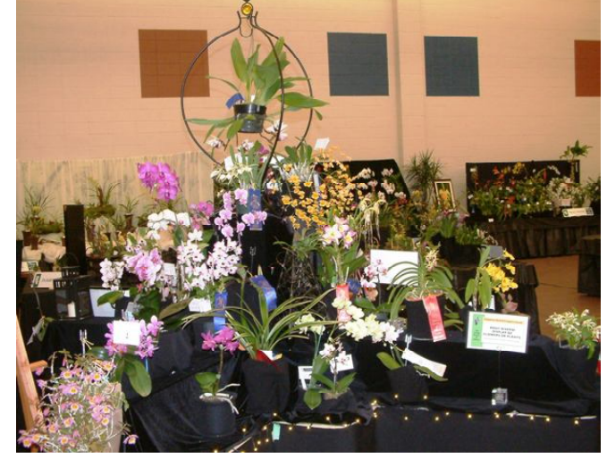
OSA display wins COC medal