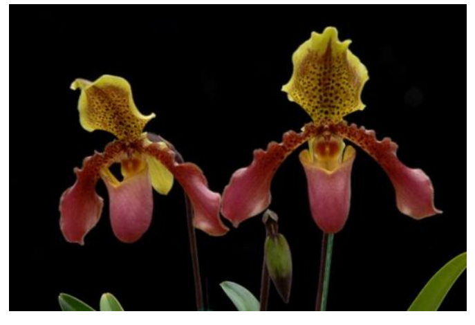
Paph. Frank Zettle 'Marinda' AM/AOS 81 pts