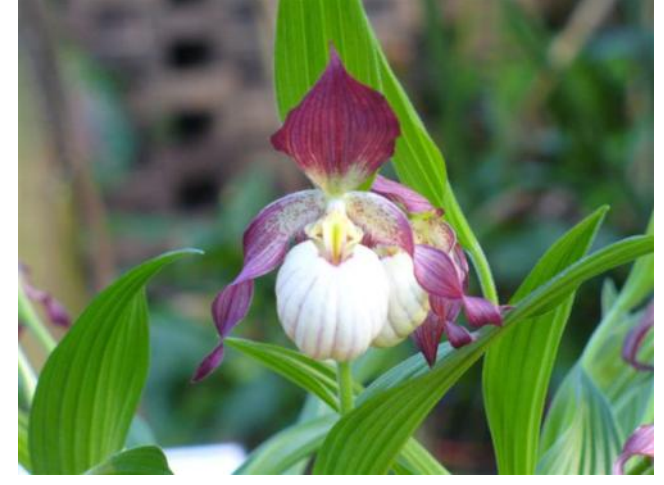
Cypripedium Gisela 'Amanda' CCM/AOS 83 pts