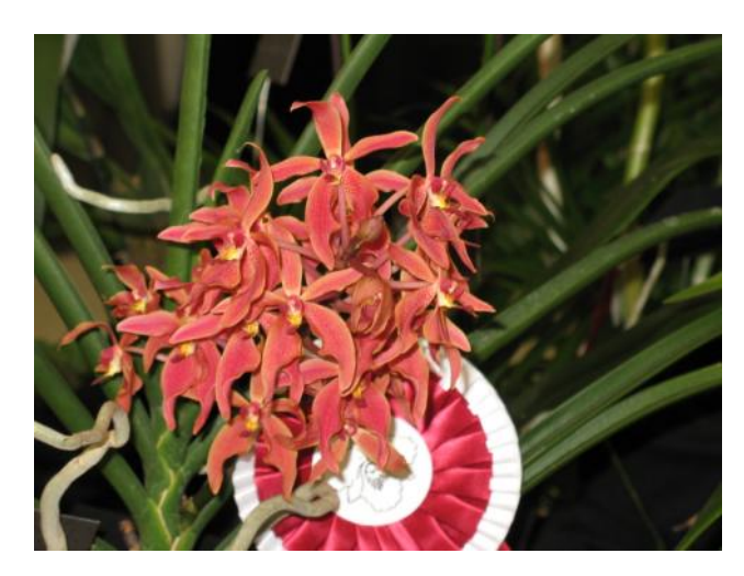
Prn. Joan Sze (Paraphalaenopsis laycockii x Renanthera Yen) COC Presidents Trophy - COOS