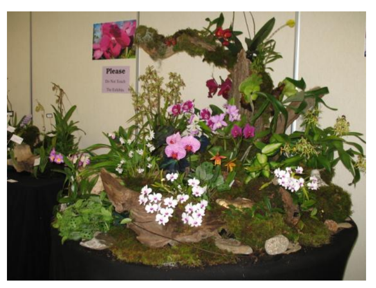
Best Society Display - Southern Ontario Orchid Society