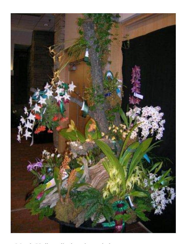
Marsh Hollow display, above, below