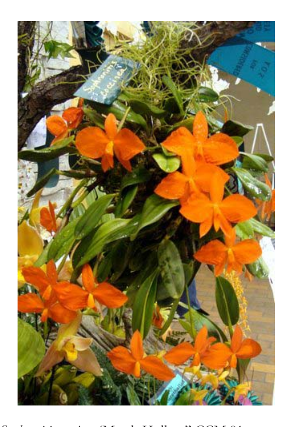
Sophronitis coccinea 'Marsh Hollow" CCM 81