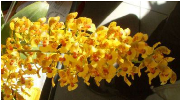
Oncidium gutfreundianum , CHM AOS