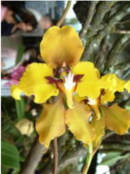
Front Photo: Telipogon andicola , AM-AOS

Material in this newsletter or on the COC website may be reprinted in society newsletters - just make sure you attribute the author and the COC.