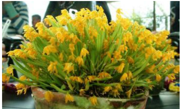
Aclanthera sonderana 'Gigi'