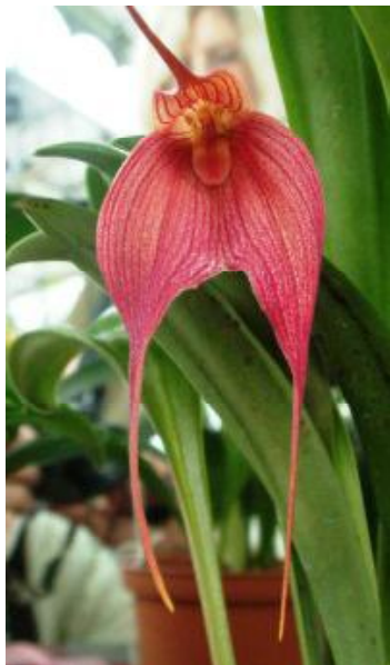
Masdevallia angulata x Dracula vampira