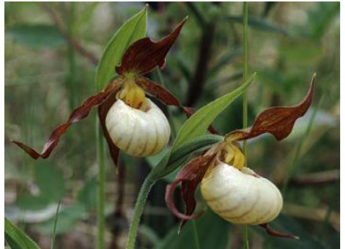
Above: Cypripedium xandrewsii Below: Cypripedium candidum

The challenge now is to determine how the information obtained from these studies can be used to protect populations of the small white lady's-slippers from further degradation of genetic purity.